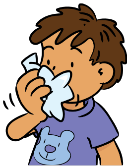
after you cough, sneeze or blow your nose