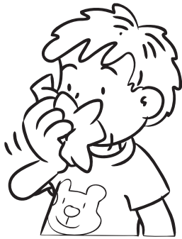
after you cough, sneeze or blow your nose