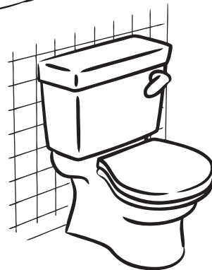
after using the bathroom