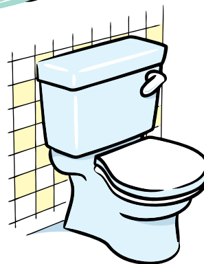
after using the bathroom